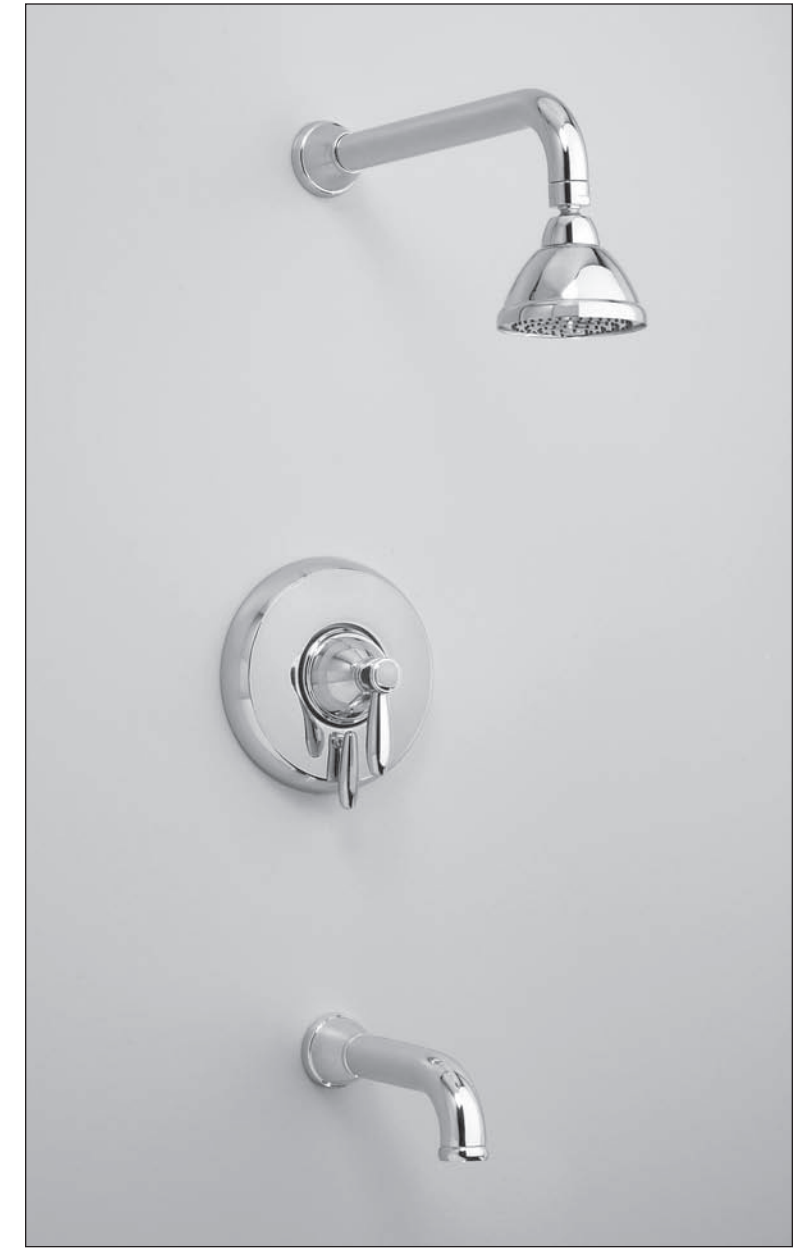
TS756PVSW#CP - Mercer™ Shower and Bath Trim